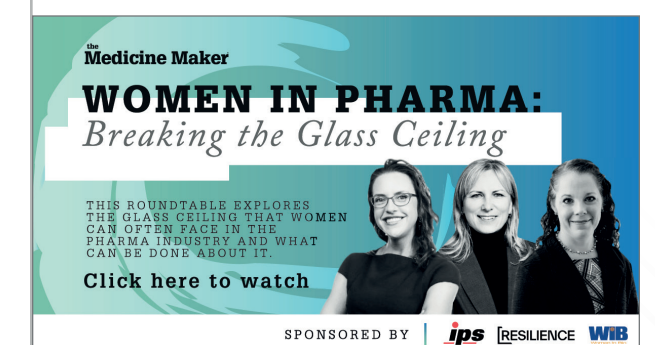
Editorially-Led Roundtable Women In Pharma