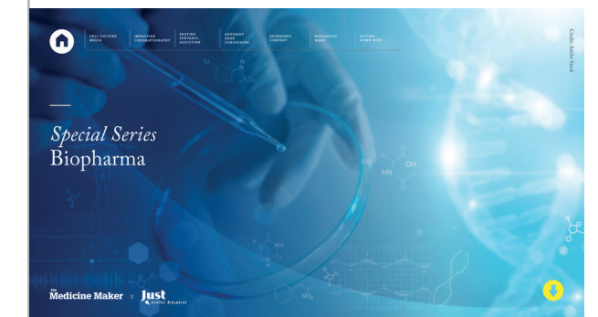
Special Series eBook Biopharma