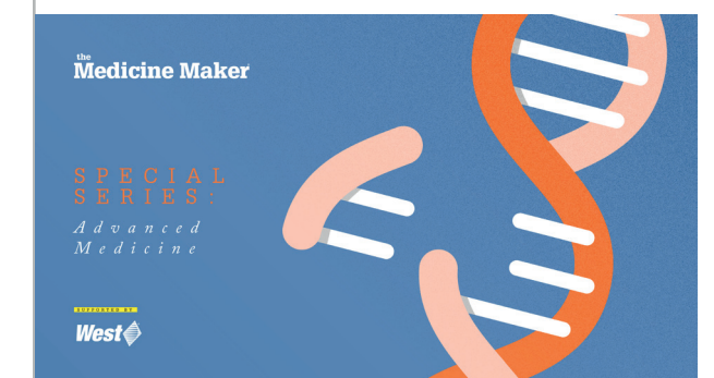
Special Series eBook Advanced Medicine